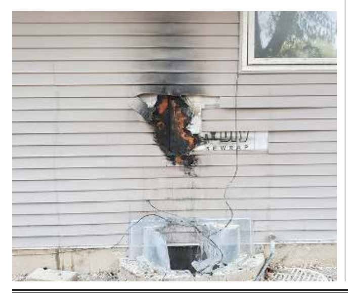
The Firehouse Scene - Page 4

Firefighters were dispatched to Jeanette Dr. on Oct. 2nd for a fire on the back of the house involving electrical lines. First in units arrived and found the fire was put out by the occupants. The fire was contained to the back of the house and damaged the siding and outer paneling of the exterior. The fire was caused by an unknown issue involving a cable junction. Fire crews checked the rest of the residence and found no further issues.