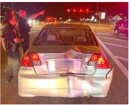
09/18/21 Hwy 251 & Elevator Rd.