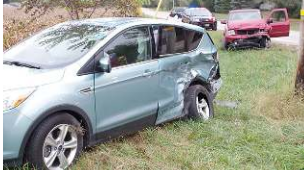
10/06/21 Prairie Hill Rd. & Pleasant Valley Rd.