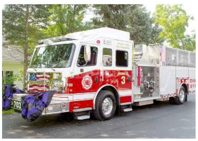
Roscoe Fall Festival Parade