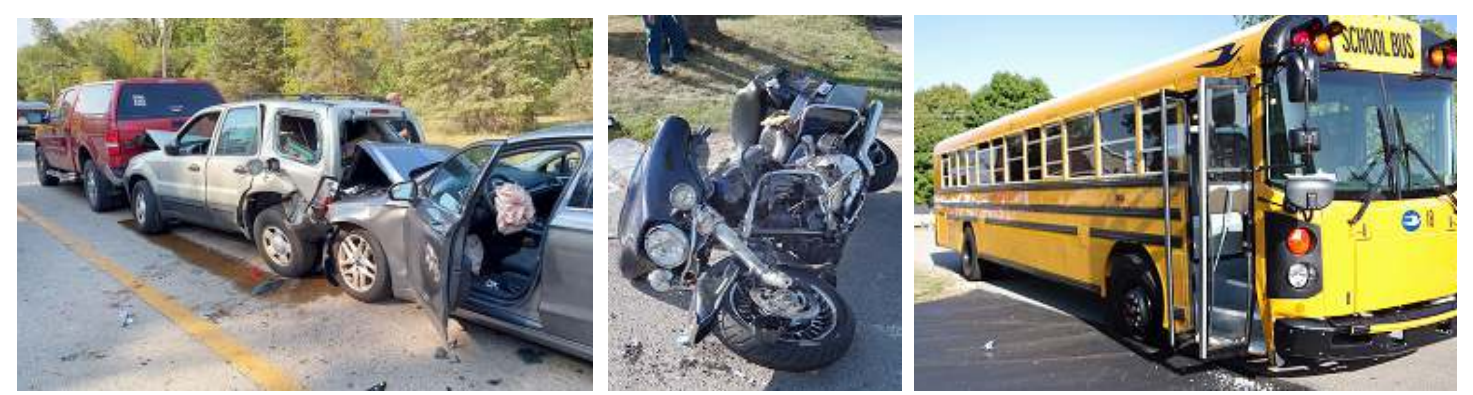
10/01/21 Hononegah Rd.