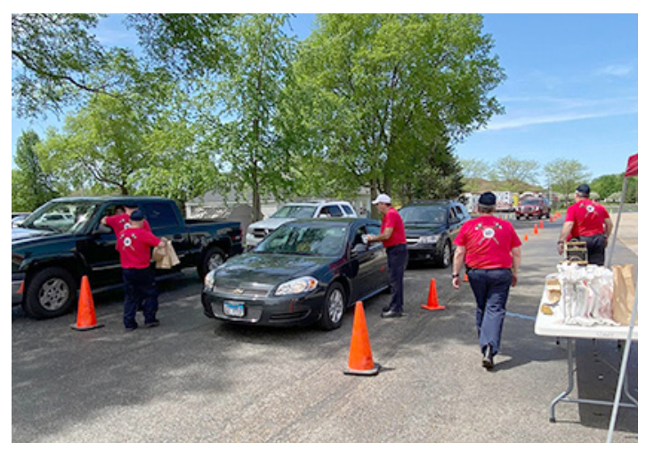
More photos from drive thru can be found on our Facebook Page.

A big shout out of thanks at our "Lunch on Us" event on Saturday May 14th. We served approximately 1000 lunches. It is a fullfilling to see the show of support for those that serve and help in our communities at a time of need. The men and women of HRFD are truly appreciative. They responded to 337 calls in May.