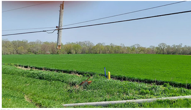
05/09/22 Prairie Hill Rd.