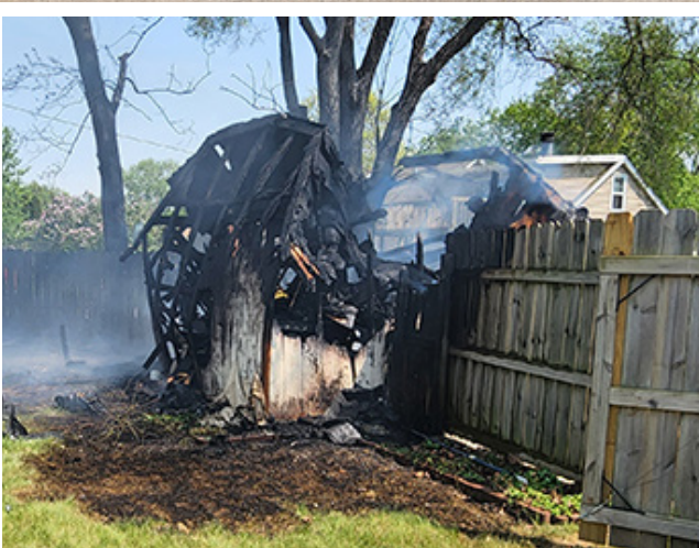
The Firehouse Scene - Page 6